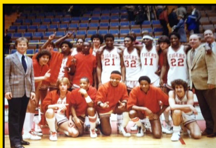
1981-82 Spring Valley Boys Basketball Team