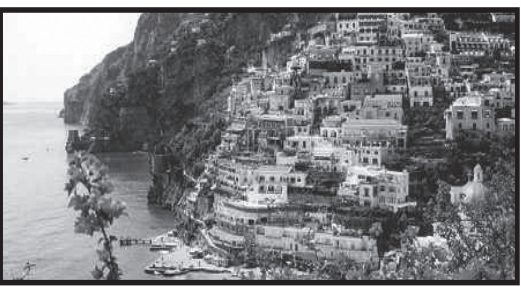
"In the food tradition of our hometown - Positano, Italy"