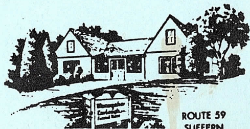
ROUTE 59 SUFFERN