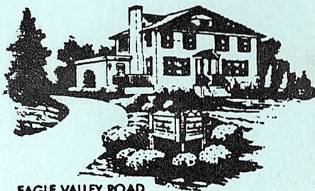
EAGLE VALLEY ROAD SLOATSBURG