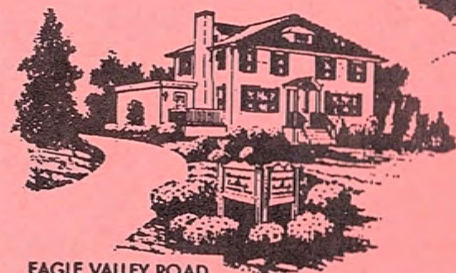
EAGLE VALLEY ROAD JOATSBURG