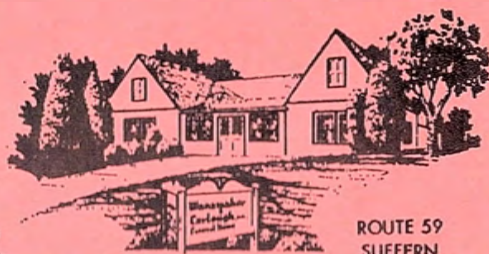
ROUTE 59 SUFFERN