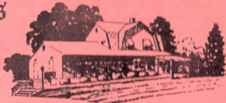
15 STATE STREET