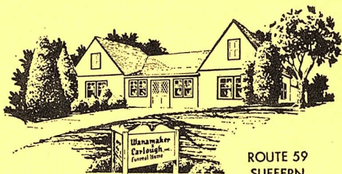
ROUTE 59 SUFFERN