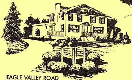
EAGLE VALLEY ROAD SLOATSBURG